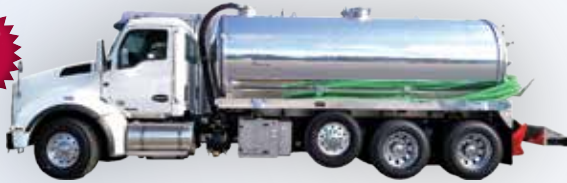
2024 T880 Kenworth 2024 T880 Kenworth, 485HP, Ultra shift 20/20/46, NVE 4310 blower package, 4500 gallon tank