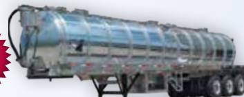
7000 - 9000 Gal. Aluminum Tri-Axle Trailers Air ride suspension (tri-axle), pump platform, bright finish, LED lights, Betts valves.