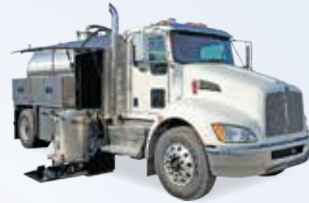
Used T370 Kenworth GREASE TRUCK

300 HP Allison Auto, 33,000 (G.V.W.R.) 1800 gallon stainless steel (ITI) tank, NVE 607 ProMax package, heat collars (heat through tank), heated cabinet for ProVac unit w/hydraulic lift, Hannay hose reel w/100' 2" hose in heated cabinet.