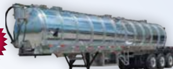
7000 - 9000 Gal. Aluminum Tri-Axle Trailers

Air ride suspension (tri-axle), pump platform, bright finish, LED lights, Betts valves.