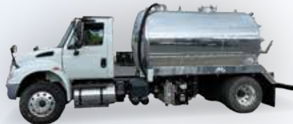
2015 International 4300

(200/4000/1400) NVE 4310, CAT jetter package