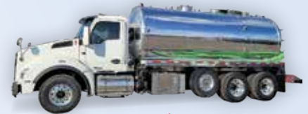
2023 T880 Kenworth Decant CALL FOR PRICING

Air ride suspension (tri-axle), pump platform, bright finish, LED lights, Betts valves.