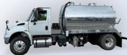
2015 International 4300 ISB250/250HP Cummins, Allison 2500 RDS, 12/21, 2,650 gallon aluminum tank, NVE 607 package

300 HP, Allison Auto, 33,000 (G.V.W.R.) 1800 gallon stainless steel (ITI) tank, NVE 607 ProMax package, heat collars (heat through tank), heated cabinet for ProVac unit w/hydraulic lift, Hannay hose reel w/100' 2" hose in heated cabinet.