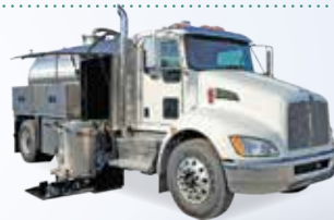
Used T370 Kenworth GREASE TRUCK

300 HP, Allison Auto, 33,000 (G.V.W.R.) 1800 gallon stainless steel (ITI) tank, NVE 607 ProMax package, heat collars (heat through tank), heated cabinet for ProVac unit w/hydraulic lift, Hannay hose reel w/100' 2" hose in heated cabinet.