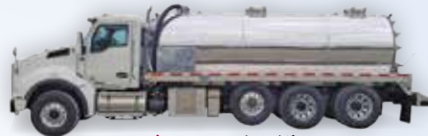
2023 Kenworth T880 CALL FOR PRICING | 20/20/46, Ultra-Shift, NVE 4310, CAT 660 jetter package, LED lights, LED strobes, 4-camera package, NAV system, alum. tank