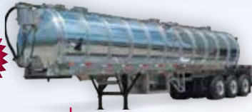
7000 - 9000 Gal. Aluminum Tri-Axle Trailers | Air ride suspension (tri-axle), pump platform, bright finish, LED lights, Betts valves.