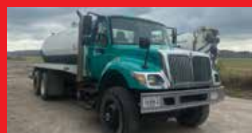
2006 International 7500 tandem truck, 363,000 miles, Allison Trans, 3,200-gallon steel tank, Masport HXL400 pump, less than 40,000 miles on new DT570 engine. Previous owner spent over $35,000 on new long block, time to replace due to depreciation. $42,000, Call 757-426-0511 (office phone, no texts). VA (P01)

ew 4,000 U.S. gallon, aluminum, vacuum tank. Mounted on a 2023 Freightliner M2-106 cab and chassis w/ a NVE Challenger 887 vacuum pressure pump package. Stock# 14056 www.VacuumSalesInc.com, (888) VAC-UNIT (822-8648). (PBM)