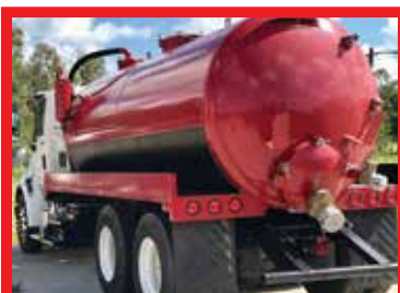
Complete Steel Vacuum Tanks available 800-5,000-gallon. All prices are not the same. We deliver anywhere. J Eagle Tanks 800-721-2774 www.Jeagletanks.com (PBM)