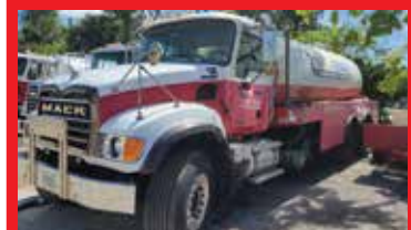
2007 Mack CV713 , 9-speed septic truck with vane pump. 4,000-gal tank. $42,000. DuAllSewerNDrain@gmail.com or 561-752-4800. FL (P01)