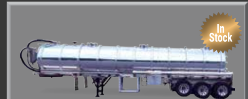
2024 9,000 GALLON TRIAXLE TRAILER