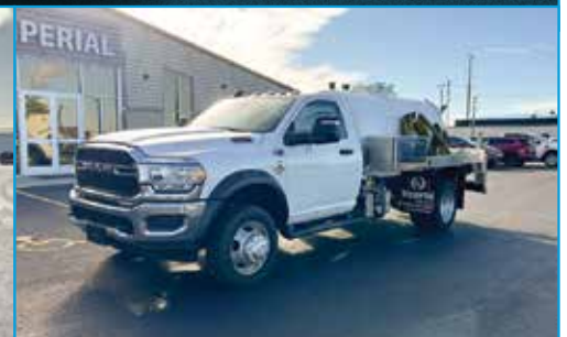
2024 RAM 5500 980-Gallon Steel Tank