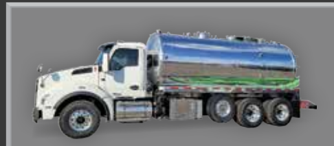
2023 T880 KENWORTH DECANT (200/4000/1400) NVE 4310, CAT JETTER PACKAGE CALL FOR PRICING