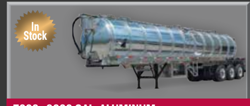
7000 - 9000 GAL. ALUMINUM TRI-AXLE TRAILERS AIR RIDE SUSPENSION (TRI-AXLE), PUMP PLATFORM, BRIGHT FINISH, LED LIGHTS, BETTS VALVES.