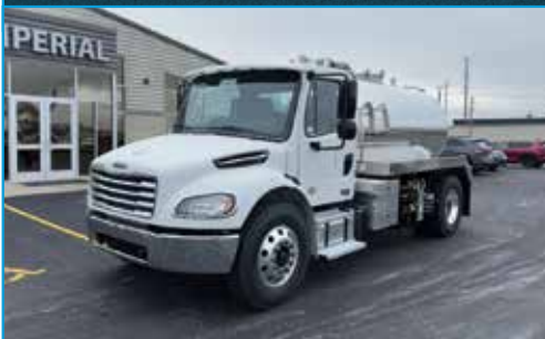
2025 FREIGHTLINER M2+ 1850-Aluminum Tank