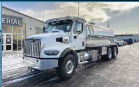
2024 WESTERN STAR 47X 4250-Aluminum Tank