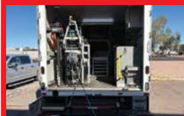
2019 Cues Ford E450 65k miles, Lamp2 DUC ready 14ft box van. 1,500-ft of gold cable with 1,000-ft of lateral launch cable with Lamp2 transporter wheel sets and pacers 6"-24". Computer without software. Van is in good working order. $250,000. Call 1-800-778-9359. AZ (P01)

IBAK Mainline pipeline inspection system with Orion & Nano pan & tilt cameras, T66 & T76 tractors, BS7 control unit, 1,000-foot cable, LISY lateral launch mounted in a 14' commercial FRP conversion box van with power retractable rear canopy & wall heater, mounted on a 2023 Ford E450. Stock #063R. www.VacuumSalesInc.com , (888) VAC-UNIT (822-8648). (PBM)