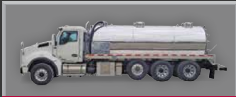
2023 KENWORTH T880 20/20/46, ULTRA-SHIFT, NVE 4310, CAT 660 JETTER PACKAGE, LED LIGHTS, LED STROBES, 4-CAMERA PACKAGE, NAV SYSTEM, ALUM. TANK • CALL FOR PRICING