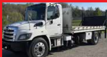
2017 Hino, JO8E-VC , diesel, 208k, auto trans, under cdl, AC, cruise, Amthor flat tank and lift gate, 800/400, 10 pot capacity, Masport HXL75 vac pump, DC10 water pump and hose reel, very clean great running truck. Finance and delivery available, $42,000.00 Hulls Truck Bodies LLC 740-820-5338 (PBM)