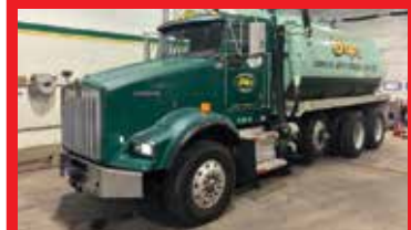
2007 KW T800 tri axle , 2012 4,200-gallon tank, Jurup pump, CAT C-13, Eaton 8LL, 353k miles and 20k hours, heated valves, tires good, brakes good. Runs, drives, and pumps well. $70,000. Call or text 860-573-0057. CT (P01)