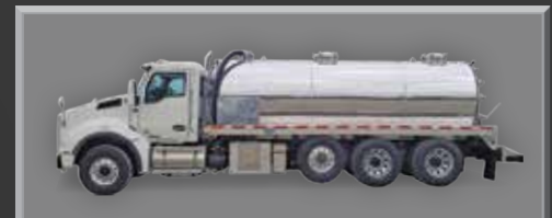
2023 KENWORTH T880 20/20/46, ULTRA-SHIFT, NVE 4310, CAT 660 JETTER PACKAGE, LED LIGHTS, LED STROBES, 4-CAMERA PACKAGE, NAV SYSTEM, ALUM. TANK - CALL FOR PRICING