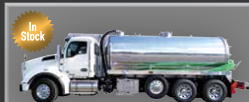
2024 T880 KENWORTH 485HP, ULTRA SHIFT 20/20/46, NVE 4310 BLOWER PACKAGE, 4500 GALLON TANK