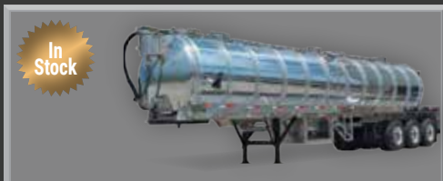
7000 - 9000 GAL. ALUMINUM TRI-AXLE TRAILERS AIR RIDE SUSPENSION (TRI-AXLE), PUMP PLATFORM, BRIGHT FINISH, LED LIGHTS, BETTS VALVES.