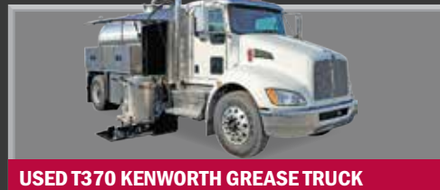
USED T370 KENWORTH GREASE TRUCK 300 HP, ALLISON AUTO, 33,000 (G.V.W.R.), 1800 GALLON STAINLESS STEEL (ITI) TANK, NVE 607 PROMAX PACKAGE, HEAT COLLARS (HEAT THROUGH TANK), HEATED CABINET FOR PROVAC UNIT W/HYDRAULIC LIFT, HANNAY HOSE REEL W/100' 2" HOSE IN HEATED CABINET.