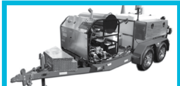
The HotJet II® is a best-selling hot- and cold-water drainline cleaner featuring a 35hp Vanguard engine by Toyota and delivering 10gpm @ 4,000psi that cleans drains up to 300' and 12" in diameter. The HotJet II® is American made using nonproprietary parts for affordability and ease in serviceability making its return on investment truly impressive. Prices subject to change. Financing available. Contact us for current pricing and availability 800-624-8186; sales@hotjetusa.com; www.hotjetusa.com (PBM)

2023 US Jetting 4018-300 jet trailer. Stock# 14107 www.VacuumSalesInc.com , (888) VAC-UNIT (822-8648). (PBM)