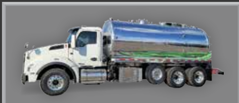
2023 T880 KENWORTH DECANT (200/4000/1400) NVE 4310, CAT JETTER PACKAGE CALL FOR PRICING