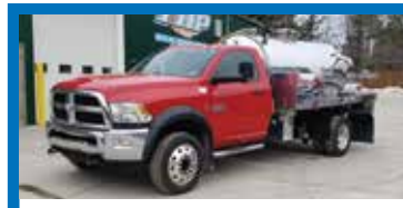
2015 Dodge 5500 , 199,000 miles, 900/300, dual side on board pressure washer, solid truck. Asking $38,000. 814-277-6227. (P05)

2012 Ford F-550 XLT, 6.7 auto, 4x4, Satellite 950 module 2 unit rack, hyd. pumping system, Burch fresh water wand system, high pressure power washer, 167k miles, stainless steel cabinets, sides and cat walks. Very sharp, $34,000. 641-420-5310. IA (P05)