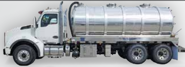
2020 Kenworth T880 | 5000 gal. aluminum vacuum tank, NVE 4310 package. IN STOCK