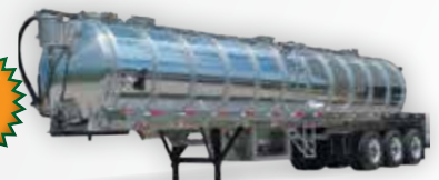
7000 - 9000 Gal. Aluminum Tri-Axle Trailers | Air ride suspension (tri-axle), pump platform, bright finish, LED lights, Betts valves.

NVE Pumps For Sale NEW ENGLAND DISTRIBUTOR NVE 866 and 4307 Packages Available