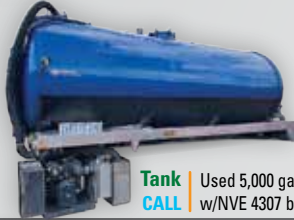
Tank CALL | Used 5,000 gal. stainless steel tank w/NVE 4307 blower package