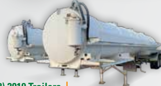
(2) 2019 Trailers | 5500 gal. steel vacuum trailers CALL FOR PRICING