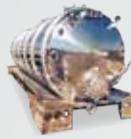
5,000 Gal. Aluminum tanks IN STOCK | Ready to mount our chassis or yours.