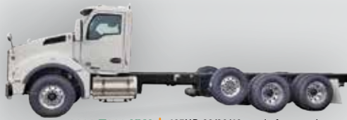
2020 T880 KW | 485HP, 20/20/46 ready for a tank Ultra-Shift (4) in stock