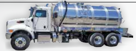
2020 Peterbilt 348 | 350HP, Allison auto, 4500 gal. aluminum tank, NVE 887 package NEW